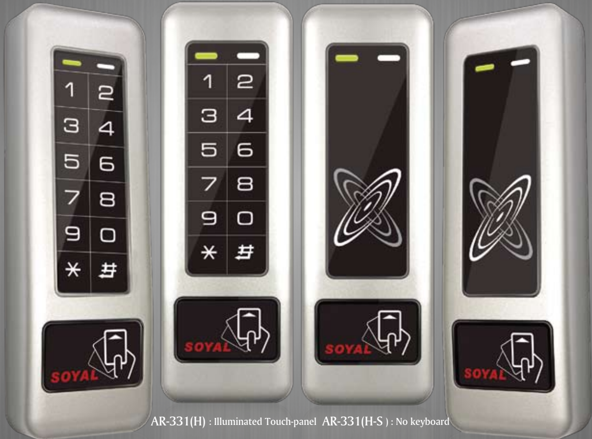
AR-331(H) : Illuminated Touch-panel AR-331(H-S) : No keyboard